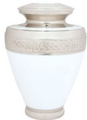
with Brass "Marble White" Urn £265