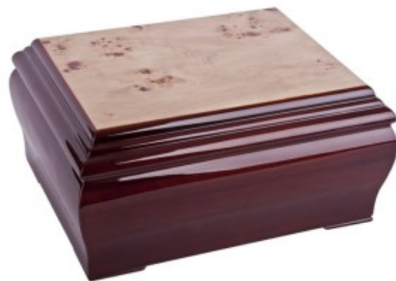
with Continental Casket £225