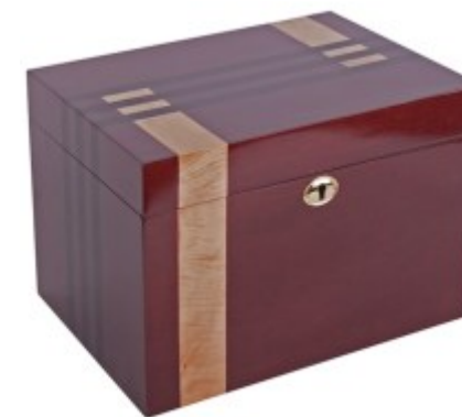
with Inlaid Wooden "Azure" Casket £245