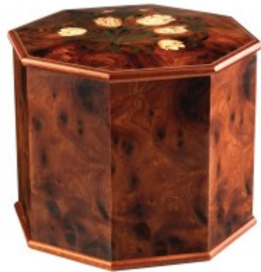
with Florence Urn £585