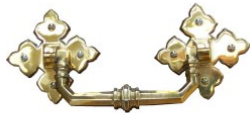
Set of Antique, Solid Brass Gothic Handles