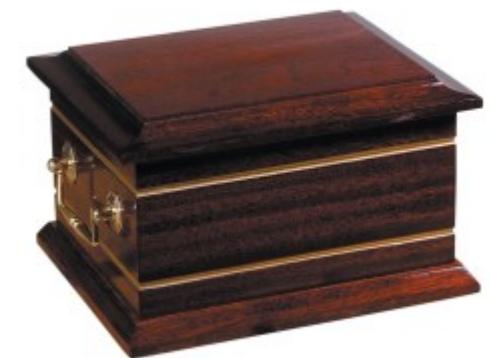
with Solid Wood "Lesbury" Urn £265

Our urn/casket prices include for the collection/receiving of the ashes, for taking responsibility for them transferring them to the container safely and for storage at our premises for up to two months. Subject to availability