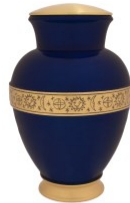
with Blue Harvest, Metal Urn £320