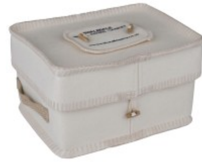
with White Woollen Urn £215