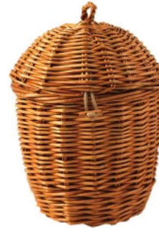
with Round Oasis Willow Urn £185