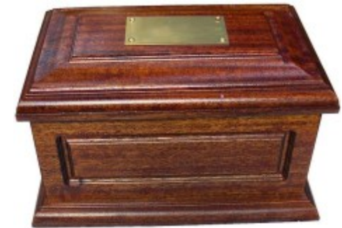
with Solid Mahogany Casket £205