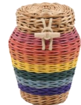
with Round Rainbow Willow Urn Handmade In Somerset £235

Our urn/casket prices include for the collection/receiving of the ashes, for taking responsibility for them transferring them to the container safely and for storage at our premises for up to thirty days Subject to availability