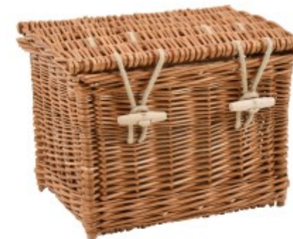
with Buff Willow Casket Handmade In Somerset £235