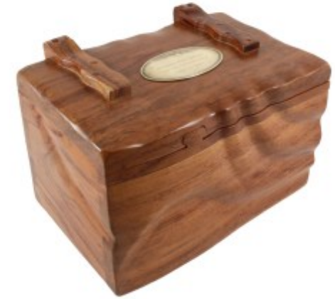
with Solid Wood "Trent" Urn £295