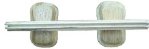
Set of Three Oak Bar Handles, and T-ends