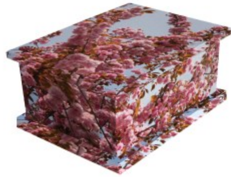
with Spring Blossom Casket £285