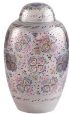
with "Grace" Urn £265