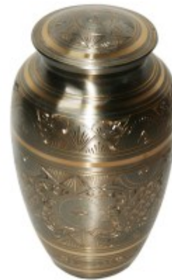
with "Sovereign" urn £255