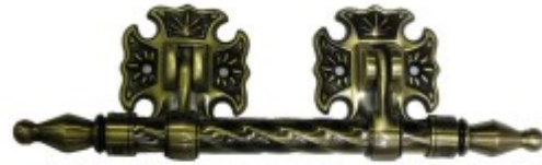
Set of Three Antique Brass Bar Handles, and T-ends