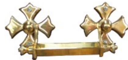
Set of Solid Brass Handles