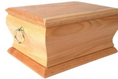
with Solid Oak Casket £205