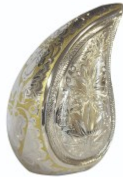
with Teardrop Patterned Urn £365.00 Inc. Keepsake - £445