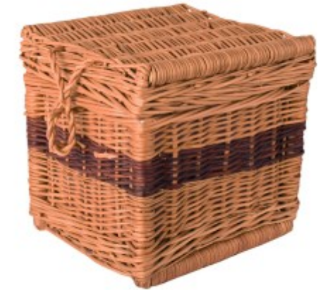
with Oasis Willow Casket £185