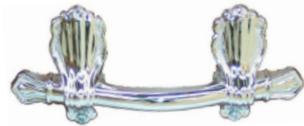
Set of Three Cast Metal Nickel Finished Doric Handles