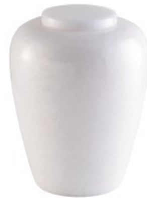
with "Simply Marble" Urn £260