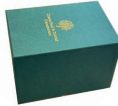
with Crematorium Box £55