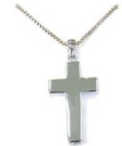
with Cross (with chain) £265.00