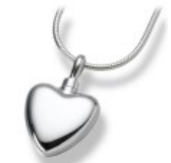
with Love Heart (no chain) £295.00

Our urn/casket prices include for the collection/ receiving of the ashes, for taking responsibility for them transferring them to the container safely and for storage at our premises for up to thirty days Subject to availability