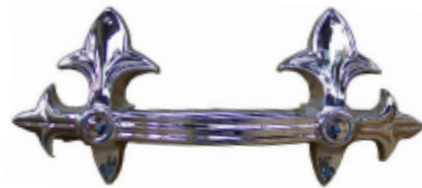
Set of Three Nickel Finished Fleur Handles.