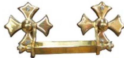
Set of Solid Brass Handles.£245.00