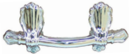
Set of Three Cast Metal Nickel Finished Doric Handles.