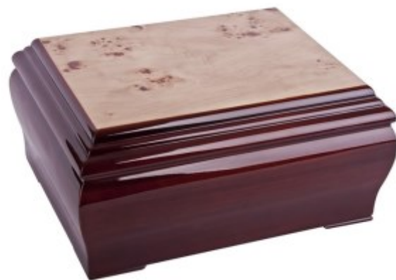
with Continental Casket £225.00