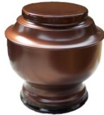
with Metal Spun Urn £165.00