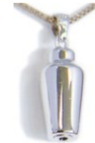
with Mini Urn Pendant (no chain) £265.00