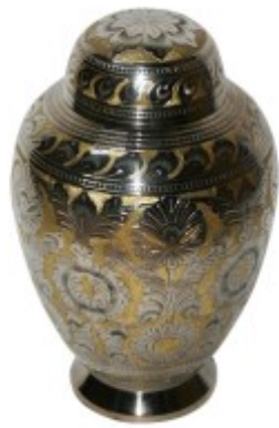
with Ambassador Urn £275.00