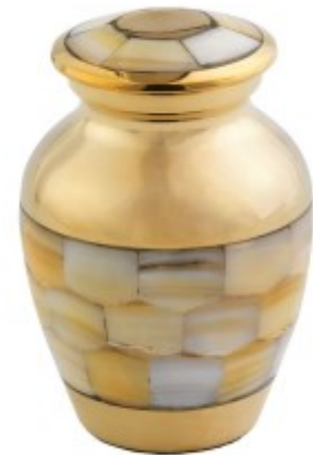
with Mosaic Urn £275.00