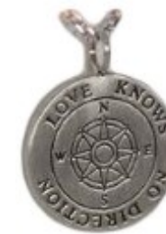
with Compass (with chain) £180.00