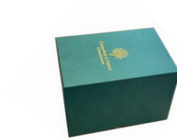
with Crematorium Box £55.00